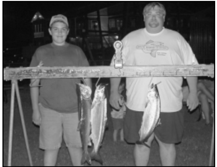
2nd place winners

Total Boats – 14 Total Anglers – 34 Adults, 12 Youths Total # of Fish Weighed-In – 17 Conditions – Sunny & South 5 mph Wind