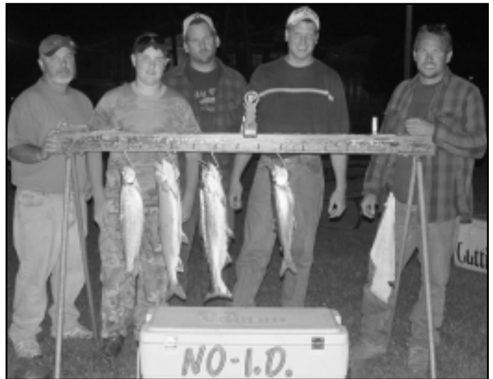
3rd place winners