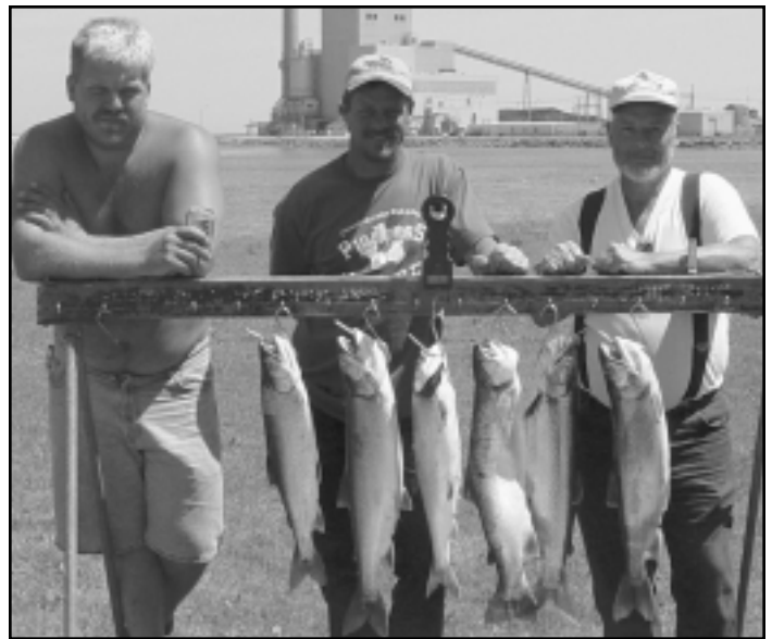
2nd place winners