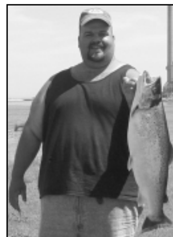
Big Fish winner