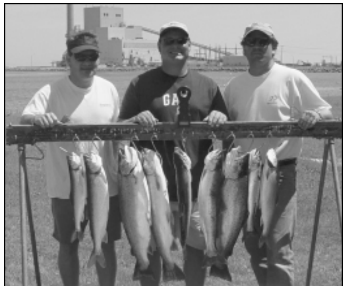
3rd place winners