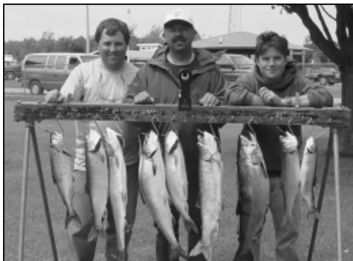
1st place winners