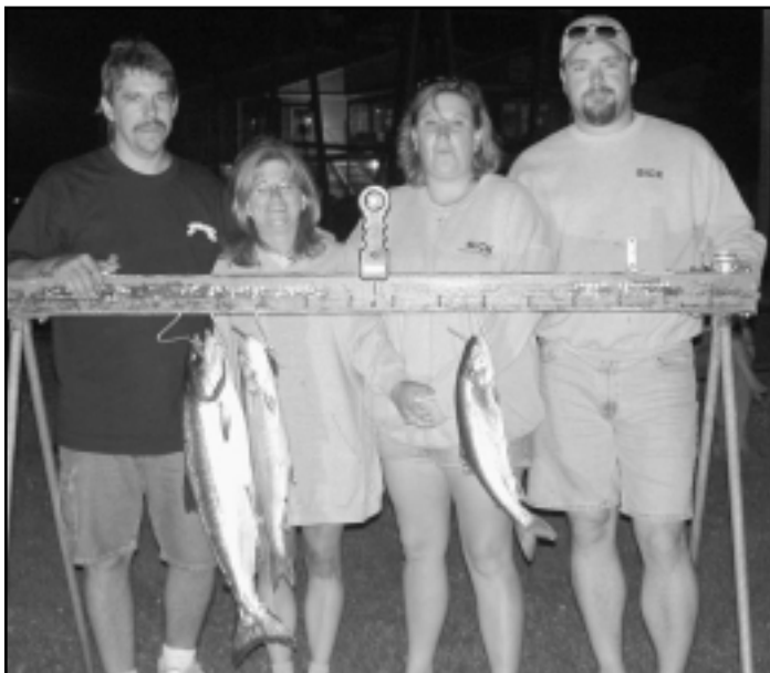
1st place winners