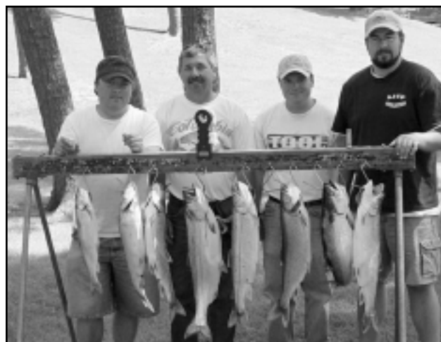
2nd place winners