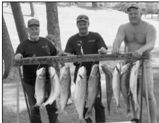
1st place winners