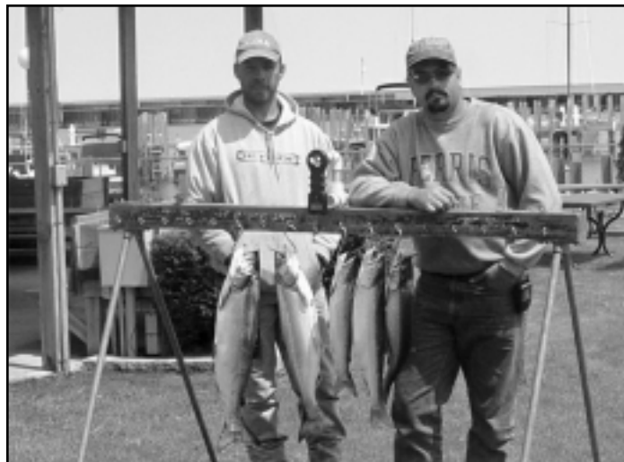
2nd place winners