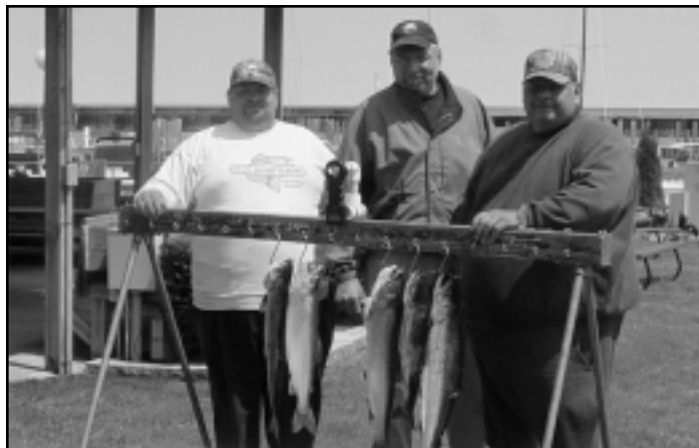
1st place winners