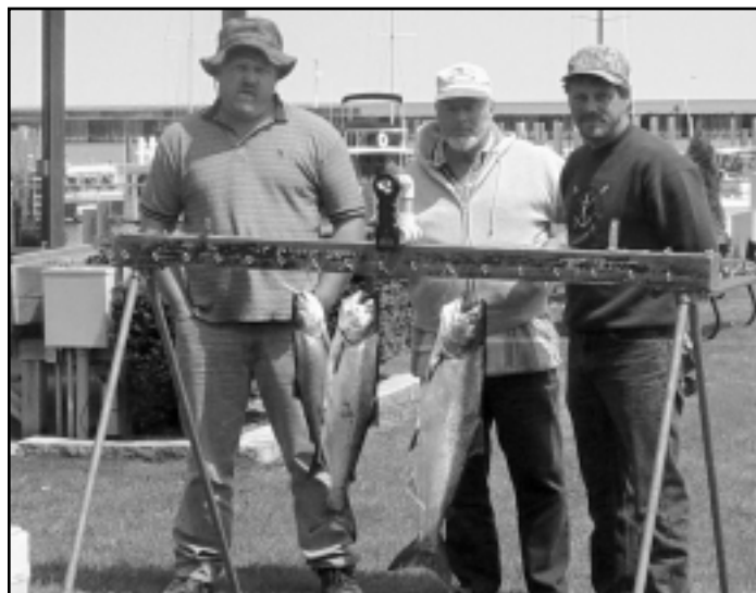
3rd place winners