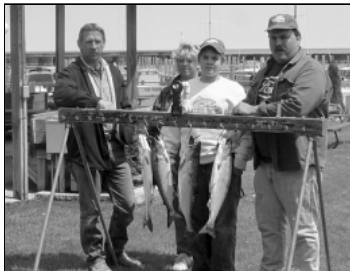
4th place winners