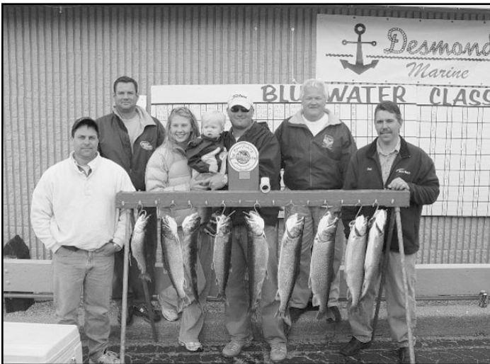
First Prize Winners