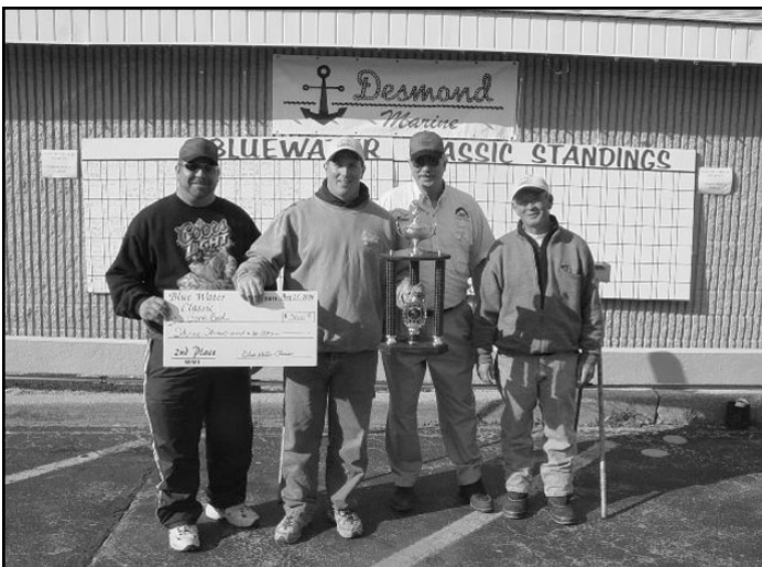
Second Prize Winners

The June 24th Twilight Tournament will be held out of Lexington, NOT Port Sanilac