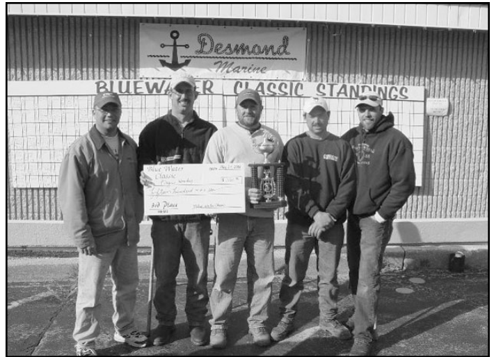
Third Prize Winners

11.66 lbs. $1000.00 Gift Certificate from Big Jons