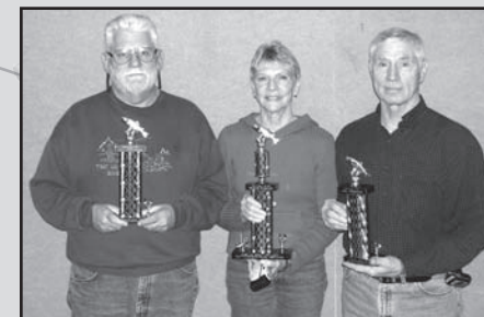
Twilight Winners Eveeady Crew

Here are winning captains and crews from the BWSA 2006 club tournament trail. Congratulations and we wish you good luck in 2007.